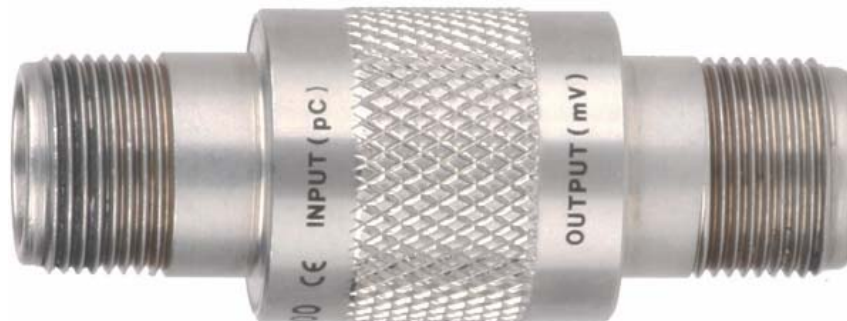
Figure 3. Charge Amplifier