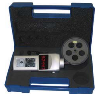
DT-107A-S12 shown in carrying case, with 12" circumference wheel