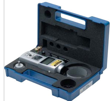
DT-205L shown in carrying case. Models: DT-205L-S12 & DT-207L-S12 w/ 12" master wheel.